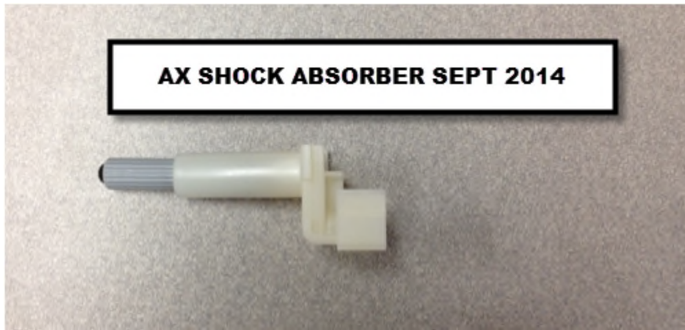
Picture 1 - AX SHOCK ABSORBER housing, 9/15/2014

To reduce the touch bar noise the AX versions are now manufactured with an AX specific SHOCK ABSORBER. The new AX SHOCK ABSORBER has characteristics required to comply with the AX performance. The AX SHOCK ABSORBER is different than the standard Von Duprin SHOCK ABSORBER. The AX SHOCK ABSORBER reduces the touch bar release noise and maintains the UL Certification as a CBC compliant product.